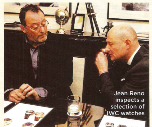
Jean Reno inspects a selection of IWC watches

Swiss watchmaker IWC Schaffhausen celebrated its new Portuguese watch collection by inviting special guests and business partners to an exclusive dinner at Espace Sécheron in Geneva. More than 600 guests attended the event, including celebrities like Zinedine Zidane and Boris Becker. Also gracing the event was French actor Jean Reno, (right) who stars in the IWC short film that was premiered that night.